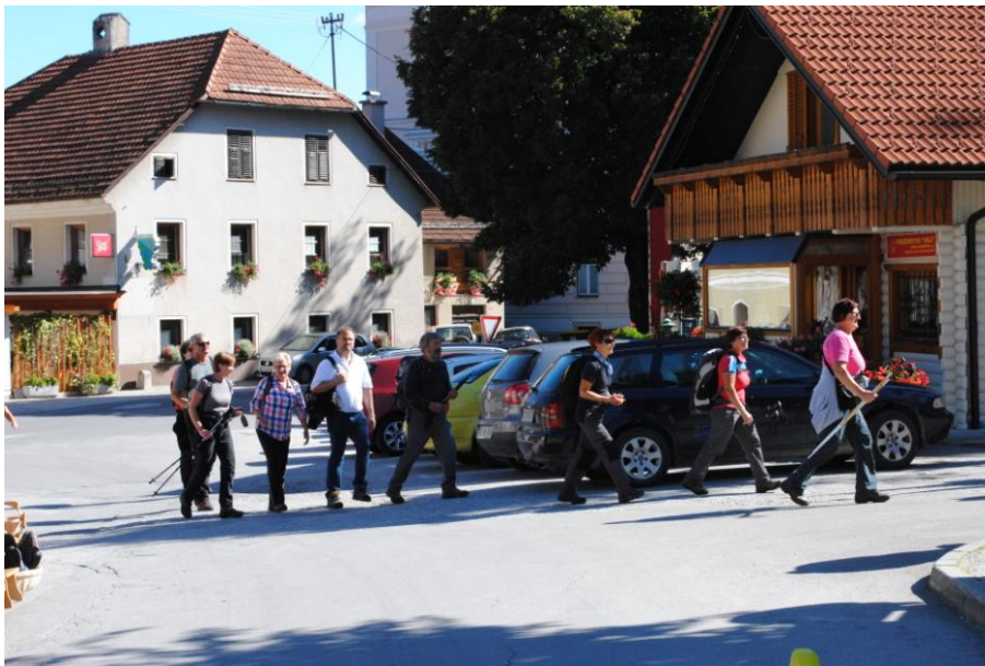
Gornji Grad on 14 September 2013

International Memorial Trail of Alliance – The Crow's flight Trail crosses the municipality Gornji Grad. A group of hikers finish their march to be present at the memorial event.